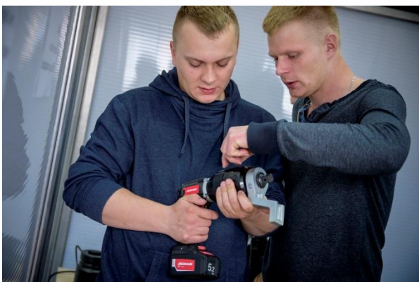
Figure 3: Training participants with an alkitronic® Battery torque multiplier EA 2/80

The good cooperation with alki TECHNIK, a reliable partner with highest quality standards, will ensure that this will continue and that the training center will also receive innovative tools in future.