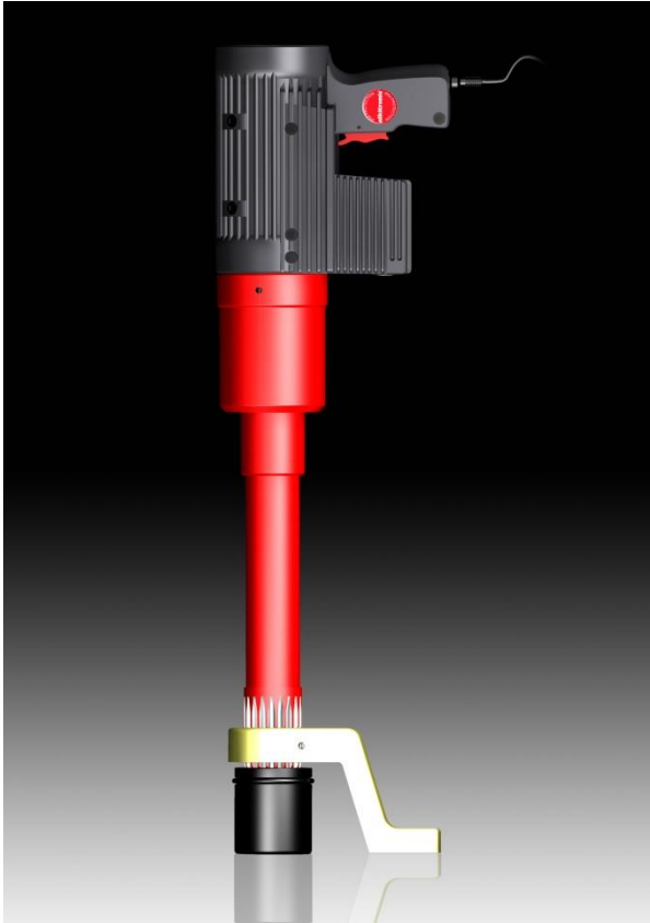
Figure 2: ECip-N by alkitronic